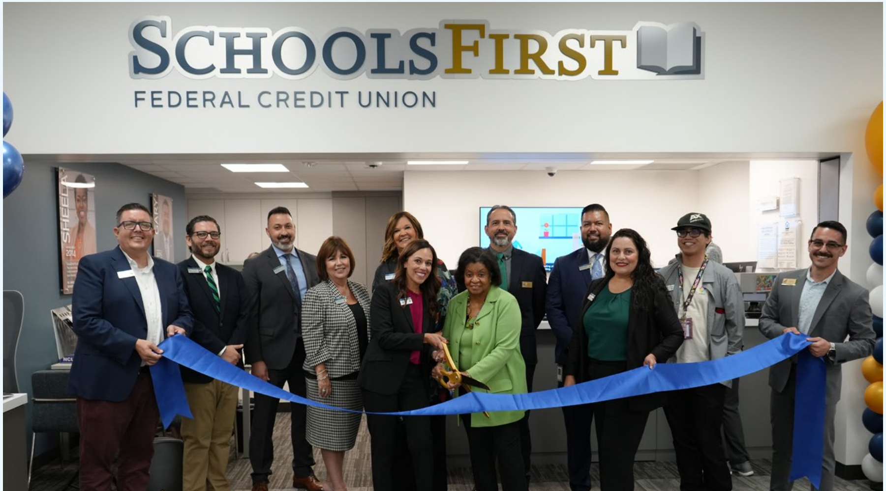
SCHOOLSFIRST FCU GRAND OPENING AT THE BRONCO BOOKSTORE SEE PG. 6